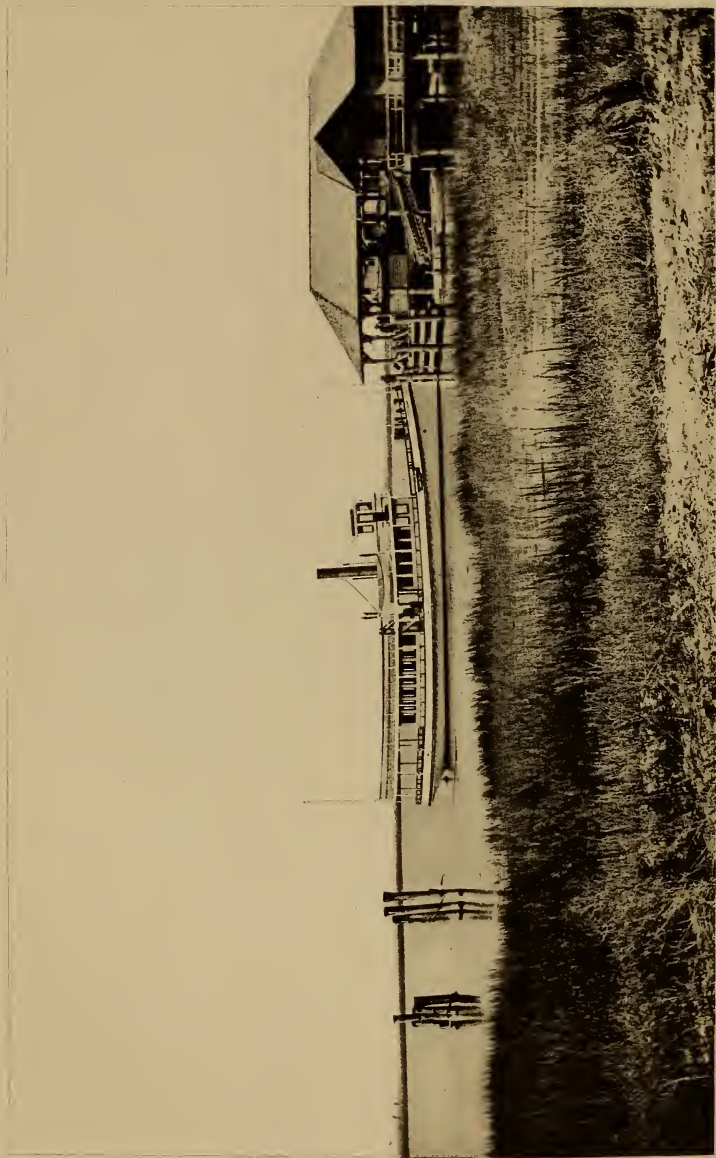
JEKYL LANDING AND STEAMER